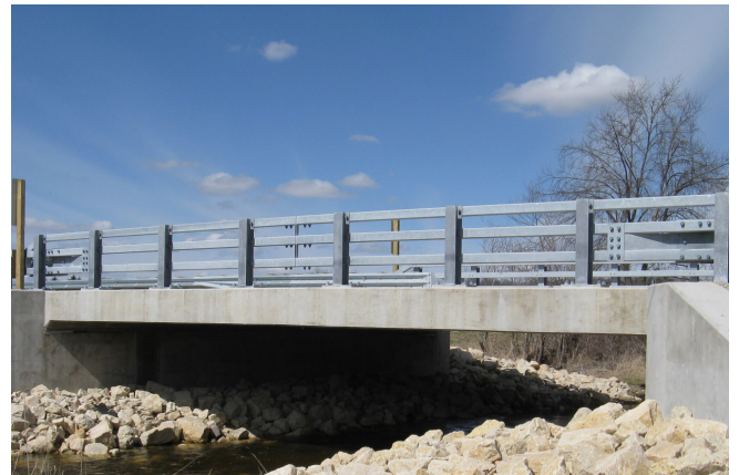
SEH delivers new or rehabilitated structures of all sizes.

We have been a leader in bridge design, maintenance, rehabilitation, inspection and upgrades. SEH structural engineers design bridges, dams, retaining walls, box culverts, underground vaults, floodwalls and gates. SEH's highly skilled bridge inspectors have inspected more than 3,000 bridges in 48 states.