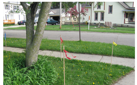
Real Estate Acquisition