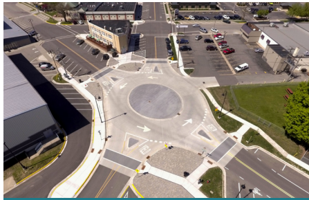
Traffic & Roundabouts